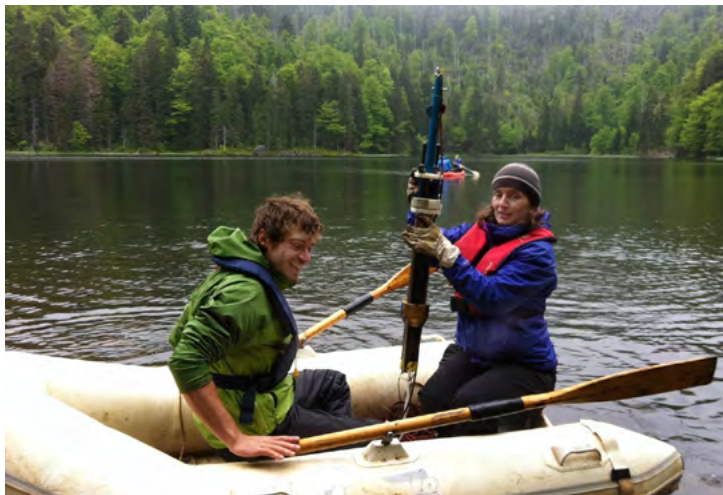
Environmental Chemists investigate air pollution, greenhouse gas emissions, or contamination of soil, water, and plants.